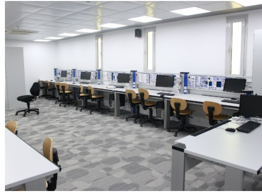
Computer Engineering Lab