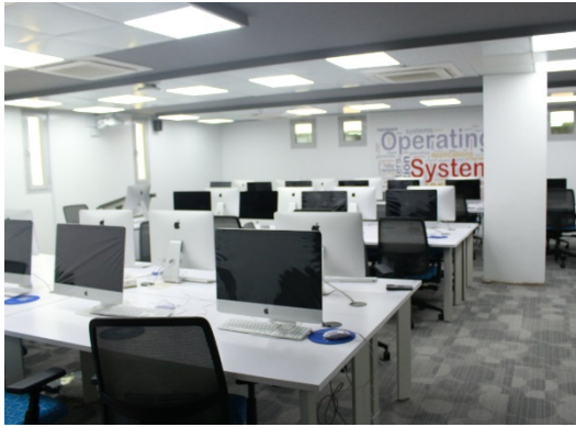
Operating Systems Lab