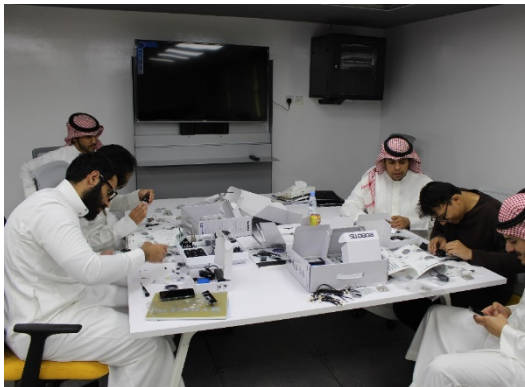
Image Processing and Robotics Lab