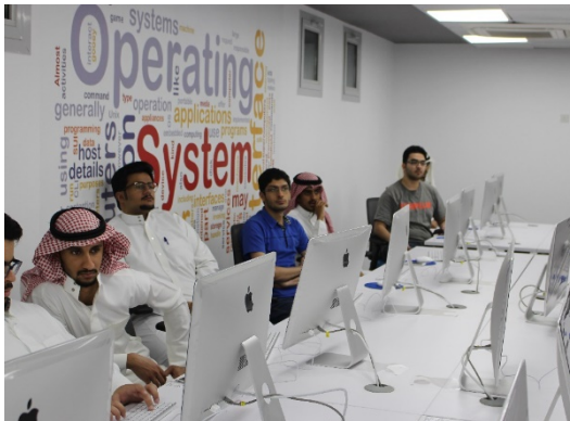
Operating Systems Lab