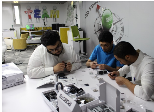
Image Processing and Robotics Lab