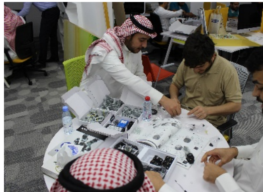
Image Processing and Robotics Lab