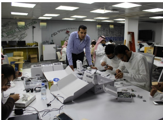
Image Processing and Robotics Lab