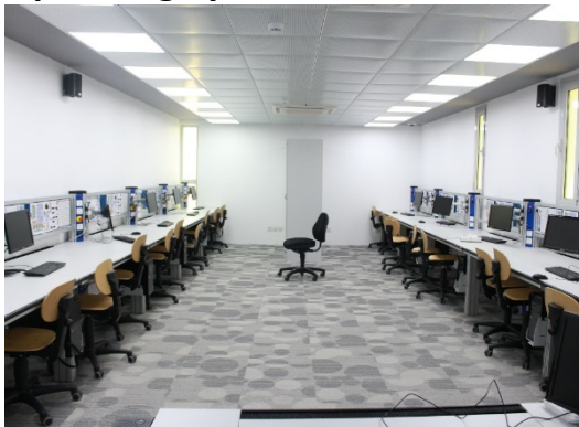
Computer Engineering Lab